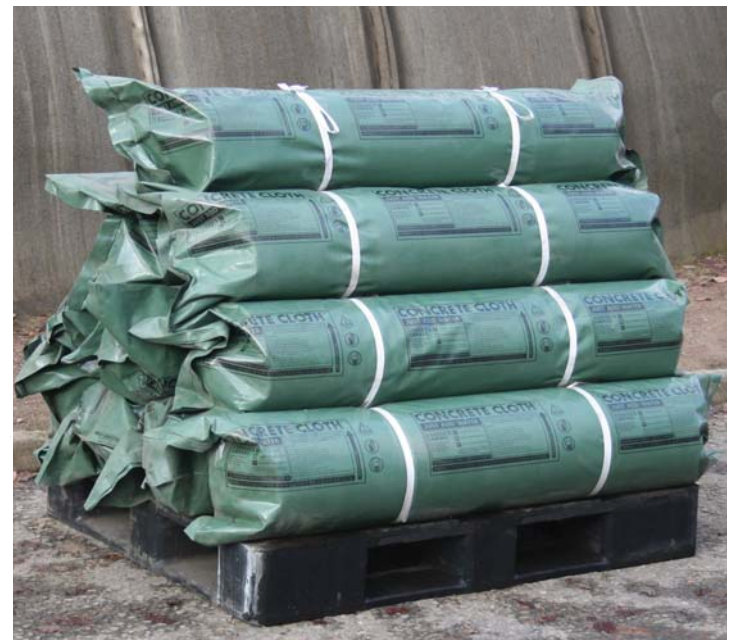
CC Batched Rolls

CC is a ceramic and will not burn. It has achieved Euroclass classification B-s1, d0 according to BS EN 13501-1:2007+A1:2009.