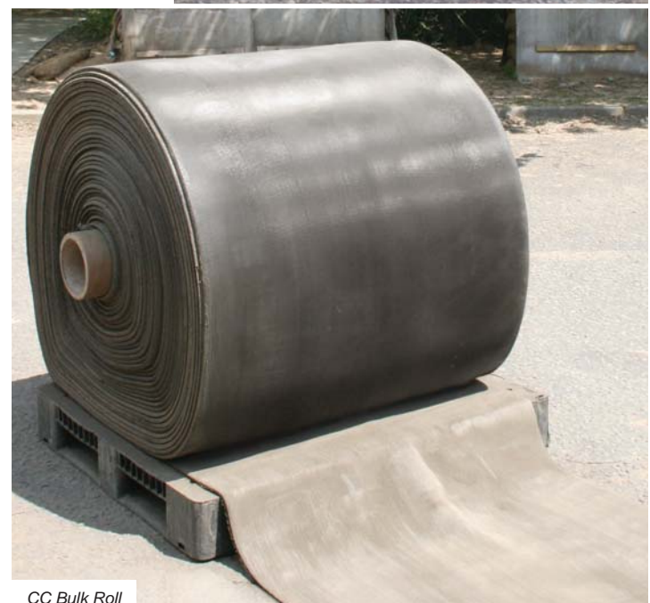
CC Bulk Roll